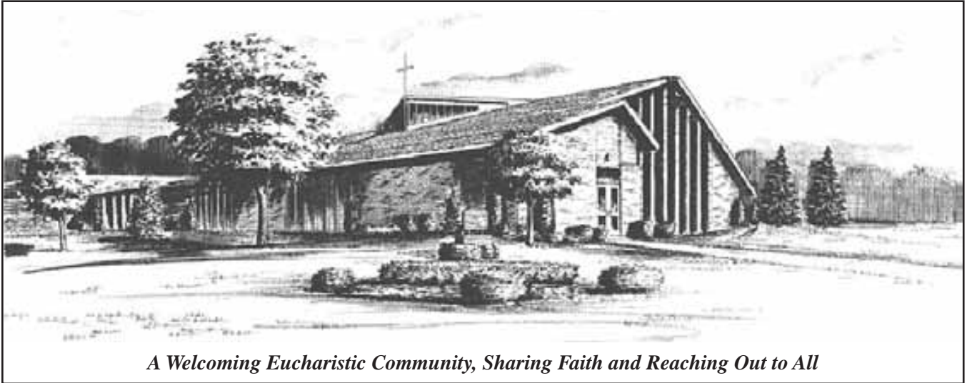
A Welcoming Eucharistic Community, Sharing Faith and Reaching Out to All

511 CHEAPSIDE ST., LONDON, ONTARIO N5Y 3X5 PHONE 519-433-6689 FAX 519-433-2301 E-MAIL: stmichlon@dol.ca www.stmichaels.dioceseoflondon.ca